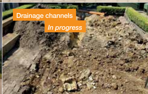
Drainage channels In progress